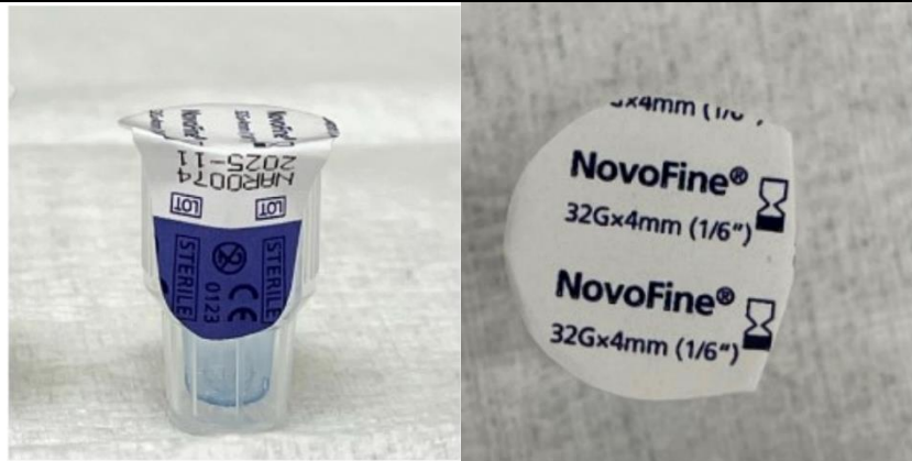
*Photos of product detected in United States of America